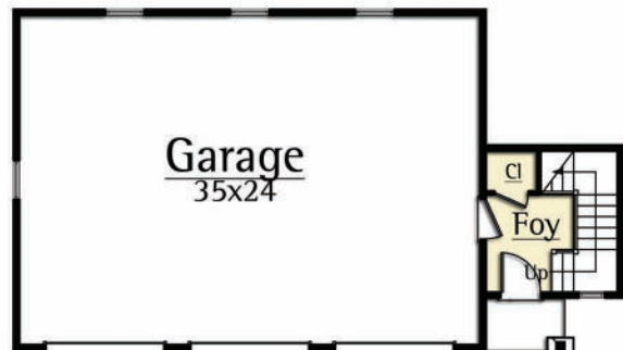
Main Level 122 square feet

ELM CARRIAGE HOUSE 1,180 total square feet