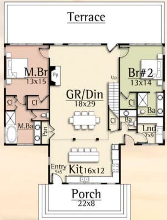
Main Level 1,758 square feet