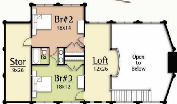
Upper Level 1,137 square feet

On the interior the Beartooth uses open plan living to create gracious entertaining space. The main level features a vaulted great room, home office, and a generous master suite. The upper level features two bedrooms and open loft that looks down to the great room